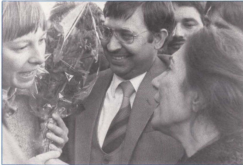
Begum Bhutto being greeted in West Germany by a Club of Life representative in West Germany.