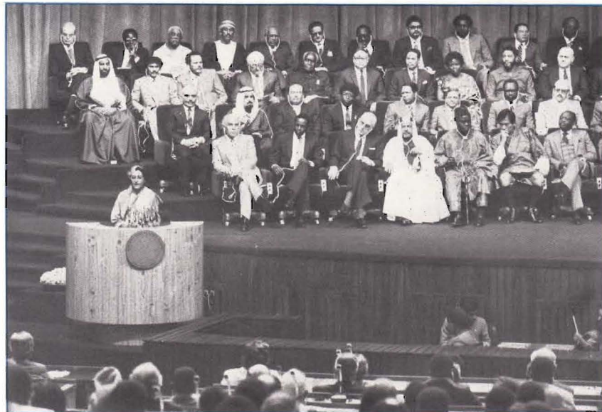
Indian Prime Minister Indira Gandhi addresses the March summit of the Non-Aligned Movement, where the Club of Life's campaign for a new world economic order had a major impact.

18-19 Paris and Washington, D.C. host international speakers at COL conferences. Helga Zepp-LaRouche and her husband, American economist and politician Lyndon H. LaRouche, Jr., address the Paris conference, outlining the crucial role of the Non-Aligned Movement in detonating the "debt bomb," a concept first elaborated by Lyndon LaRouche in his celebrated August 1982 policy proposal "Operation Juarez." Joining with the LaRouches are prominent spokesmen from India, Africa and Western Europe. Parallel conferences gathered over 3000 peo-