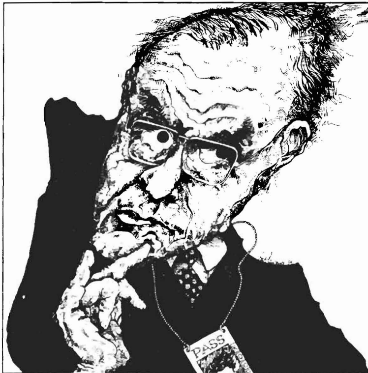
LYNDON LAROUCHE