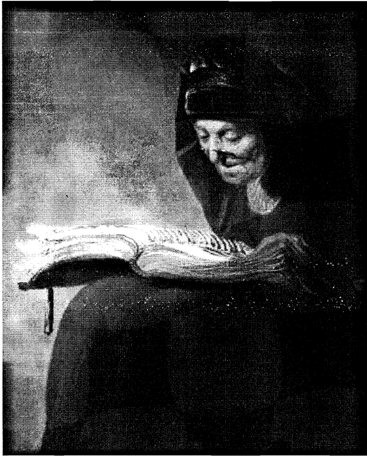
Contrary to the Obama Administration, human beings are not animals, to be slaughtered when they grow old or sick. Shown is "Rembrandt's Mother Reading," by Rembrandt van Rijn, 1629.

trine of the Obama administration, mankind is not an animal to be slaughtered, or starved to death when the person is sick or old; men and women represent a higher order of creature than all of the beasts. This is a quality of that spirit of a living human individual which, only briefly, inhabits a specifically human biological form. The human mind which inhabits a mortal body, is a truly immortal being, one which, although it, ironically, occupies a living body temporarily, has a power of creativity, a power of creating ideas of that special quality which we associate with such expressions as "the human soul."