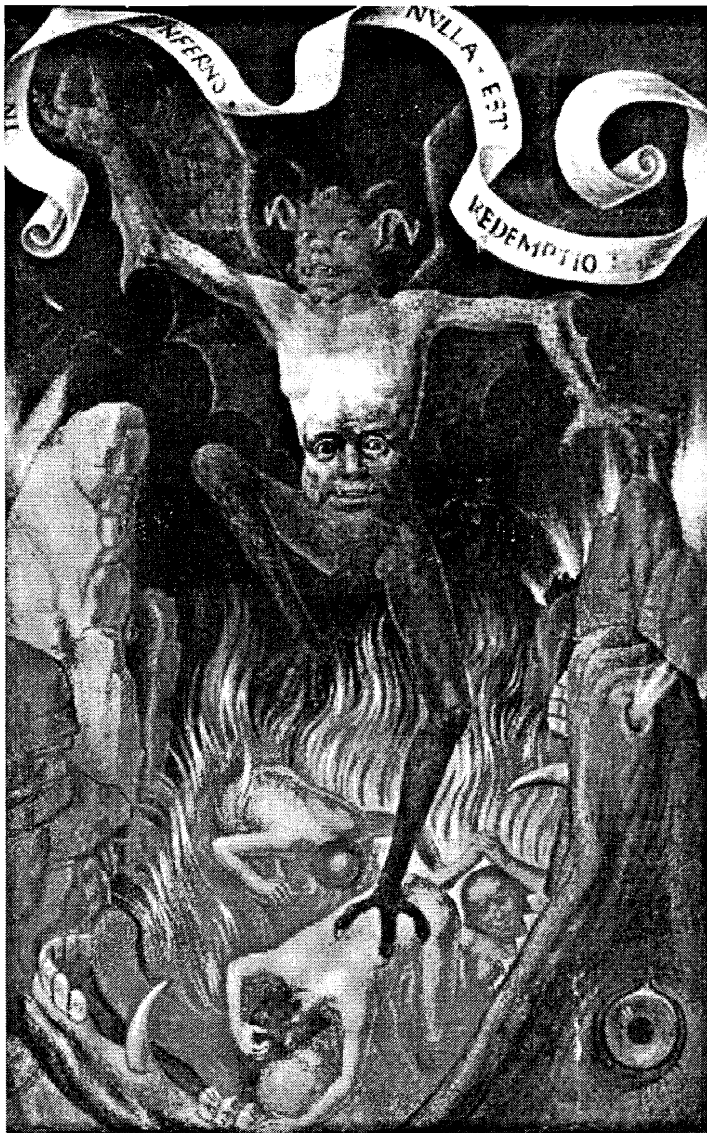
Hans Memling, "Hell" (detail), 1485. "What, then," LaRouche writes, "is the proper intention of my expression, 'Liberally Satanic'?"

have participated in bringing down upon themselves.